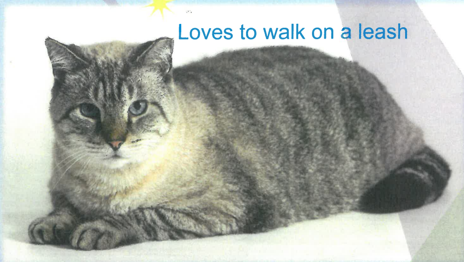
★ Loves to walk on a leash

FIV stands for Feline Immunodeficiency Virus. It's a lentivirus, meaning that it progresses very slowly, gradually affecting a cat's immune system. It is passed through blood transfusions and through serious, penetrating bite wounds - mainly by stray, intact tom cats. The most well-known lentivirus in humans is HIV. But the two are not at all the same, and you can't get FIV from a cat. In fact, the only thing about FIV that you can catch is a bad case of the rumors. Despite what many people think, cats with this condition can live perfectly long, happy, healthy lives.