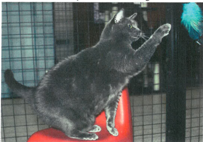
Tootsie exercises with an interactive feather toy