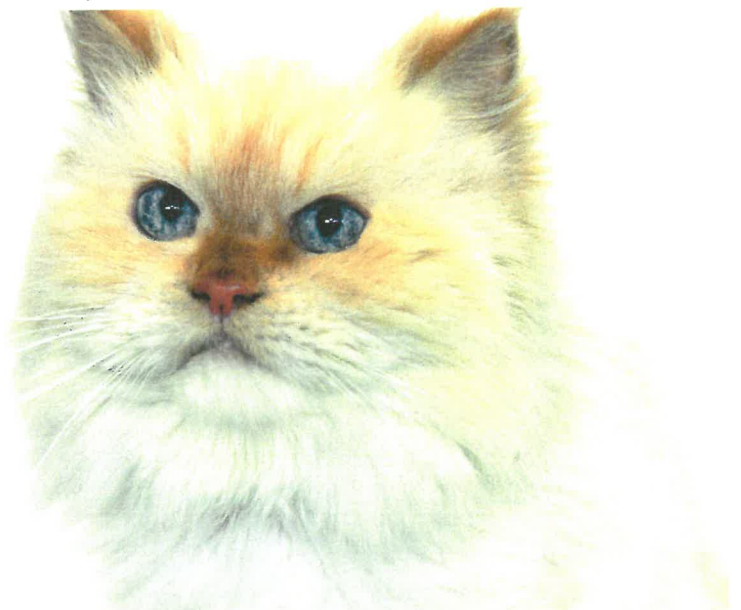
Nestle, a 5 pound, male Himalayan

How fortunate for Nestle that the language of love can be expressed in so many ways.