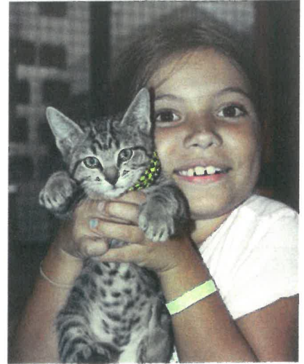
Sharing the Love