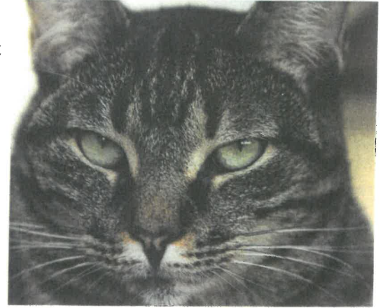
Kiki is looking for love

Kiki came to Cat Depot from a "hoarding" household. Barely a year old, she arrived filthy, full of fleas, and with four young kittens in tow.