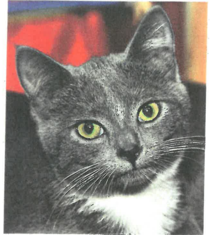
Muffin, rescued off the streets, undernourished and dehydrated

The best way to control overpopulation of community cats is to manage cat colonies through spay and neuter efforts. Cat Depot supports these efforts through a full circle program that includes registration of colonies, availability of humane traps, free and no-cost sterilization resources, educational classes on both safe trapping procedures and colony care, a cat