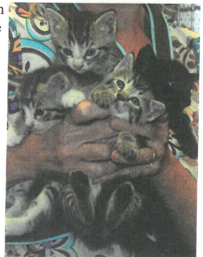
The rescued kittens, Sunshine, Pippa, Pepper and Merlin

It took four long months, Cat Depot's medical intervention, and many dedicated volunteers to give this story about Sunshine, Pippa, Pepper, Merlin, Misty (the mother), and Storm (the father) a happy ending. The entire family is available for adoption and waiting for you at Cat Depot.