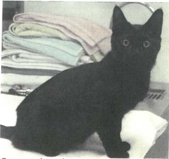
Pepper, on the road to recovery, came in with pneumonia and a collapsed lung

A growing number of individuals have registered their feral cat colonies in Cat Depot's Community Cat Program. Some cats are personal pets, but the majority are free roaming, or what we call community cats.